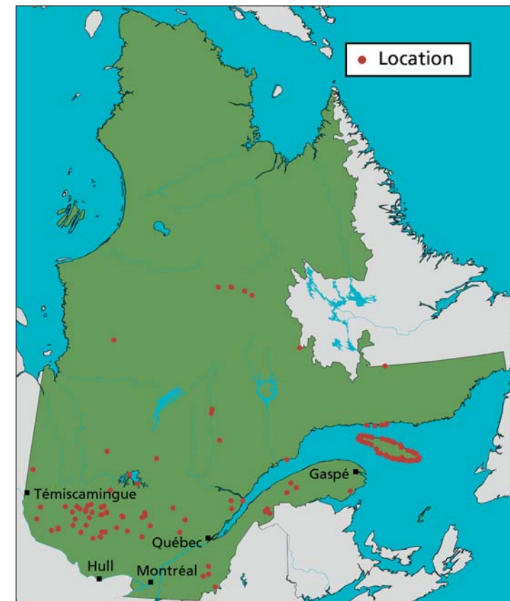
Suivi de l'occupation des stations de nidification des populations d'oiseaux en péril du Québec (SOS-POP) and Centre de données sur le patrimoine naturel du Québec

Most of the reported catches happen between October 18 and December 15, during the migratory period. The most critical time is in November.