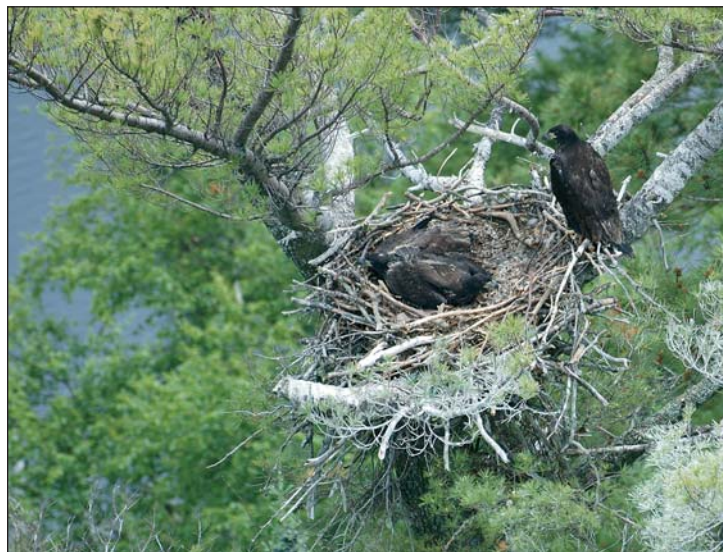
Jean Lapointe, ministère des Ressources naturelles et de la Faune

Figure 2: The bald eagle nest has a diameter from 1.5 to 2 m, a height from 0.5 to 2 m and is located between the last third of the tree and the top. In Québec, white pines are mostly used, but the form and the size of the tree are more important than its species.